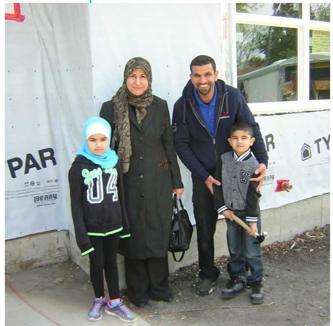
The Akhbari Family